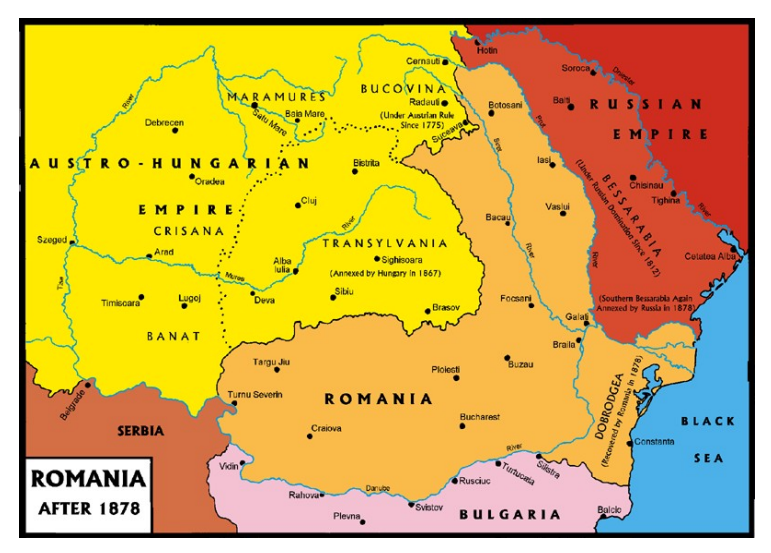
(from Treptow, 1996)

century). In the 19<sup>th</sup> century two of the kingdoms, Moldova, without Bessarabia, and Walachia benefited from favourable geopolitical circumstances to unite under the name of Romania.